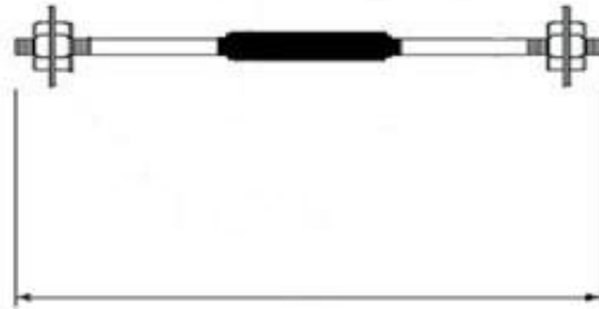
5/16" Diameter by 8" Long Sensor

Because of their low profile design, these sensors can be used in concrete pavements, columns, walls, bridge elements or wherever dynamic strains need to be measured.