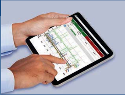
WEB-BASED MOBILE SENSOR CONDITIONING