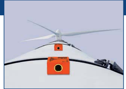
LONG TERM DYNAMIC STRUCTURAL STRAIN ANALYSIS